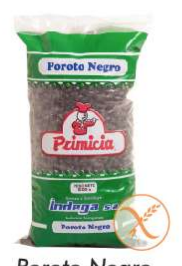
Poroto Negro 10 x 200g - 10 x 500g 5kg - 30kg