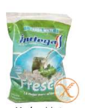
Yerba Mate FRESCA! (plástico)

6 x 250g - 12 x 250g 6 x 500g - 10 x 500g