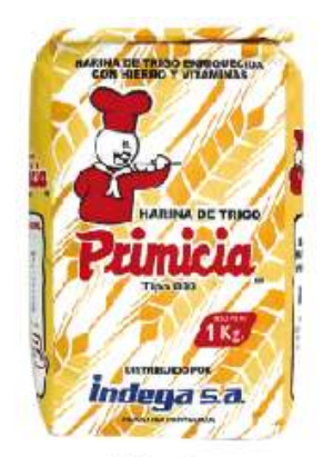
Harina Tipo 000 × 250a - 10 × 50

10 x 250g - 10 x 500g 10 x 1kg - 4kg - 5kg