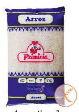
Arroz tipo 1 Largo Fino 10 x 250g. - 10 x 500g 10 x 1kg - 5kg - 30kg