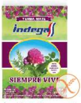
Yerba Mate Compuesta Siempre Vive

6 x 250g - 12 x 250g 6 x 500g - 10 x 500g