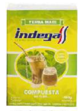
Yerba Mate Compuesta NATURAL

20 x 250g - 10 x 500g 20 x 500g - 10 x 1kg