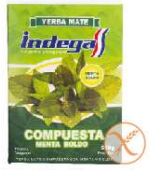
Yerba Mate Compuesta Menta - Boldo

6 x 250g - 12 x 250g 6 x 500g - 10 x 500g