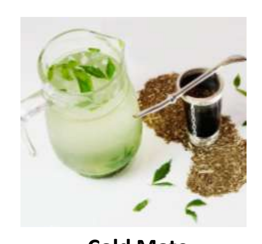
Cold Mate Commonly called "Terere". It's prepared in the same way, but it is served with cold water and ice cubes. It's very refreshing in.

Commonly called "Terere". It's prepared in the same way, but it is served with cold water and ice cubes. It's very refreshing in the summer time.