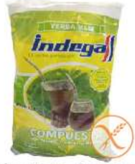
Yerba Mate Compuesta NATURAL (plástico)

6 x 250g - 12 x 250g 6 x 500g - 10 x 500g