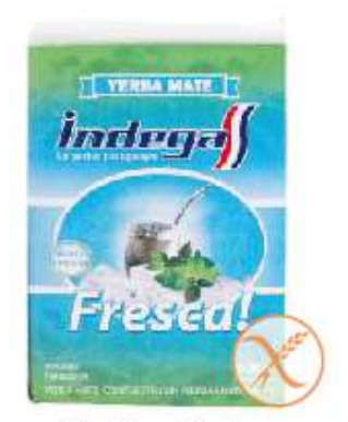
Yerba Mate FRESCA!

6 x 250g - 12 x 250g 6 x 500g - 10 x 500g