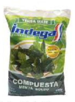
Yerba Mate Compuesta Menta - Boldo (plástico)

6 x 250g - 12 x 250g 6 x 500g - 10 x 500g