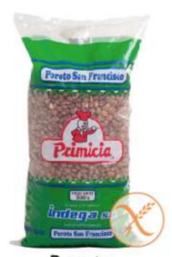
Poroto San Francisco 10 x 200g - 10 x 500g 5kg - 30kg