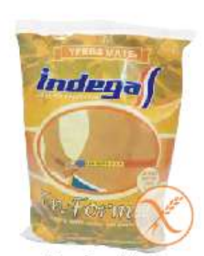
Yerba Mate En Forma (plástico)

6 x 250g - 12 x 250g 6 x 500g - 10 x 500g