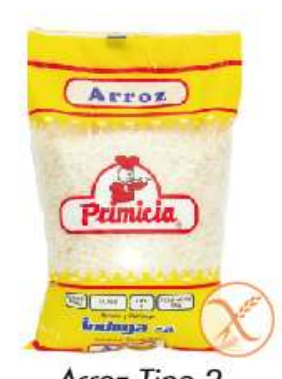
Arroz Tipo 2 Largo Fino 20 x 250g. - 20 x 500g 10 x 500g - 10 x 1kg