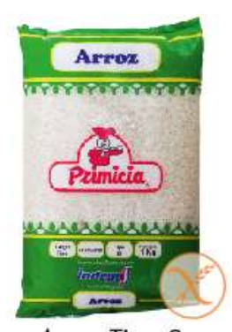
Arroz Tipo 3 Largo Fino 10 x 500g - 10 x 1kg 5kg - 30kg