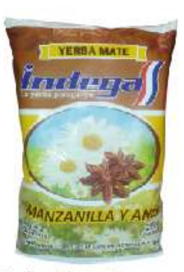
Yerba Mate Compuesta Manzanilla y Anís (plástico)

6 x 250g - 12 x 250g 6 x 500g - 10 x 500g