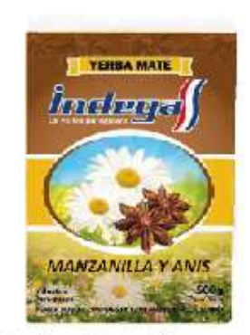
Yerba Mate Compuesta Manzanilla y Anís

6 x 250g - 12 x 250g 6 x 500g - 10 x 500g