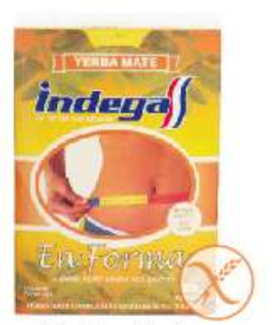
Yerba Mate En Forma

6 x 250g - 12 x 250g 6 x 500g - 10 x 500g