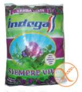
Yerba Mate Compuesta Siempre Vive (plástico)

6 x 250g - 12 x 250g 6 x 500g - 10 x 500g