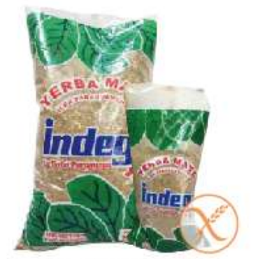
Yerba Mate Clásica

25 x 100g - 50 x 100g 10 x 250g - 20 x 250g 10 x 500g - 20 x 500g 10 x 1kg - 3kg - 5kg - 20kg