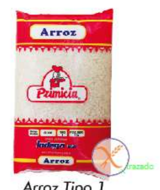
Arroz Tipo 1 Grano Grueso 10 x 250g - 10 x 500g 10 x 1kg - 5kg - 30kg