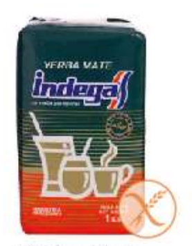
Yerba Mate Especial

25 x 100g - 50 x 100g 10 x 250g - 20 x 250g 10 x 500g - 20 x 500g 10 x 1kg - 3kg - 5kg - 20kg